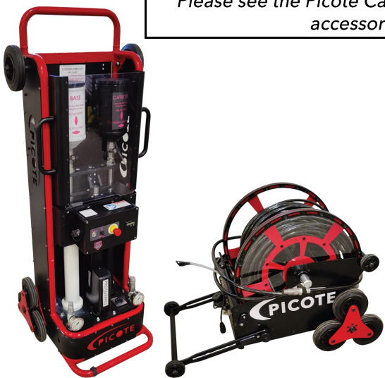
System includes: Xpress Pump, Hose Reel, Reel Heating Blanket, Small Diameter Hose Package, and 10 Static Mixing Tips & Y-Fitting Package