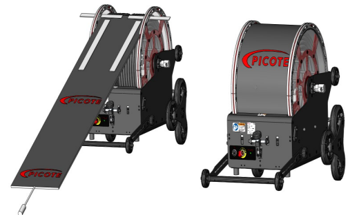
Picote Xpress Reel Heating Blanket