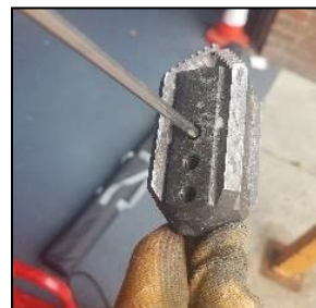
Tighten screws starting with the screw furthest away from the shaft end