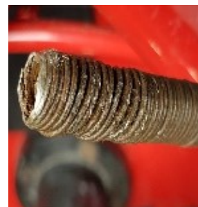
Trim back damaged Shaft